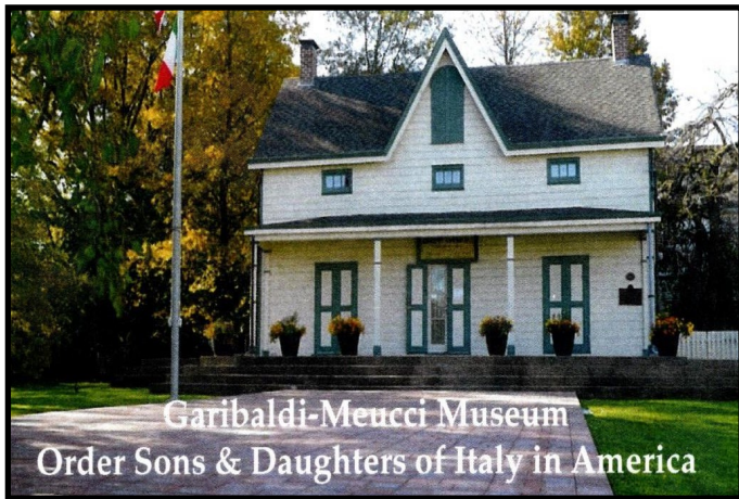
Garibaldi-Meucci Museum Order Sons & Daughters of Italy in America

Order Sons & Daughters of Italy in America Grand Lodge of California