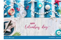
TABLE DECORATIONS FOR LODGE MEETINGS