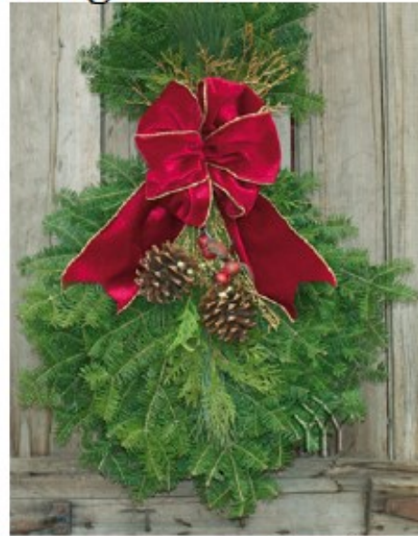
Cranberry Splash Spray

Matches the Classic Wreath, and may be used by itself, or, it is often seen gracing either side of a garage or entryway pillars with the Classic Wreath gracing the entry door to the home. The Classic Spray uses a combination of Balsam Fir, Cedar, and Pine, and is trimmed with the same elements as the Classic Wreath.